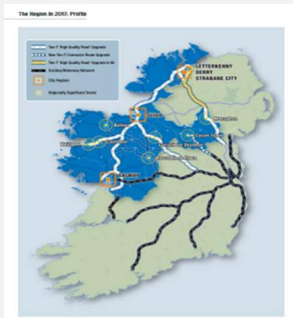
Map: Priority Road Projects in the NWRA.

(b) Prioritise investment in the Electricity Grid Network and Road Infrastructure to a Ten-T 'High Quality Road Standard' to the Northern and Western region, thus providing lifeline routes to rural communities, enabling access to essential goods and services, such as education, healthcare and employment that are necessary to sustain rural communities.