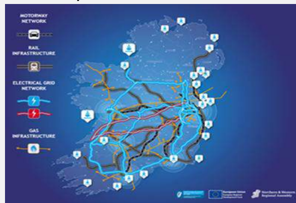
Figure: Layers of Infrastructure, motorway extensions

The gap is widening and without appropriate intervention presents a threat of greater uneven regional development. The economic underperformance could arguably be explained by the endemic lack of infrastructure in the region, which a potential gamechanger like the NPF could and should mitigate (See Figure below and the NWRA submission to the NPF Issues and Choices consultation).