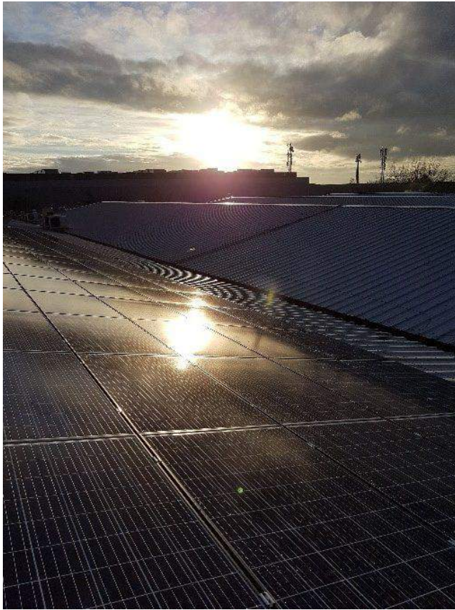
Figure 3: 420kW Rooftop Installation for Self-Supply at Butlers Chocolates (Gaelectric)

It is important that local distributed generation and self-supply is encouraged. This has significant benefits environmentally and from a system efficiency perspective.