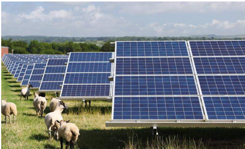
Figure 2: Sheep Grazing Around Solar Panels (Lightsource Renewables)

In many cases the dual use of the land can be considered. In particular, some solar sites may be suitable for grazing sheep and this has proven to be a successful tried and tested dual use of the land for agriculture.