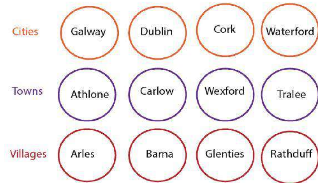
Figure 1: New graded system to help organise Ireland properly.

This list should be done county by county including the north of Ireland. In all of these places we should look at education, government investment and many other key areas of growth and employment. If we don't examine every single thing from the smallest village up then we don't know what we're dealing with and if we don't know what we're dealing with then we're not in control and certainly not running the country effectively.