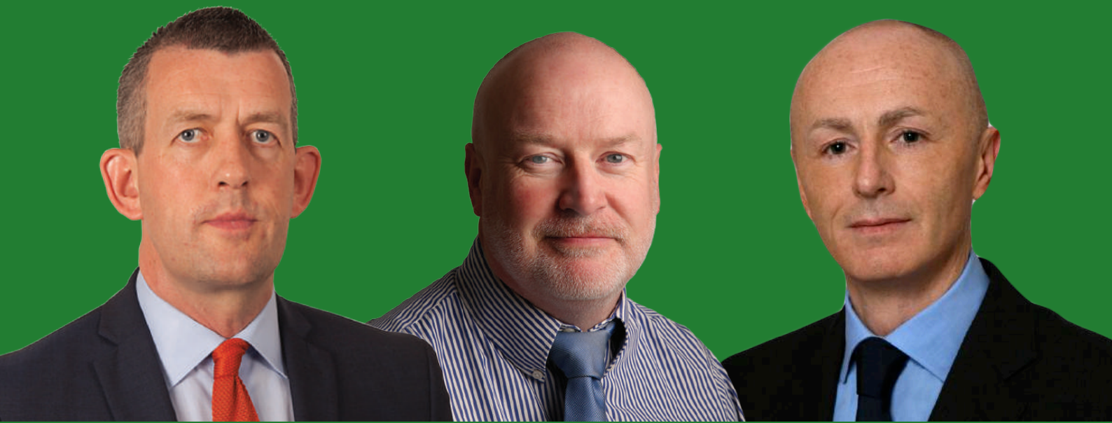
Deputy Maurice Quinlivan