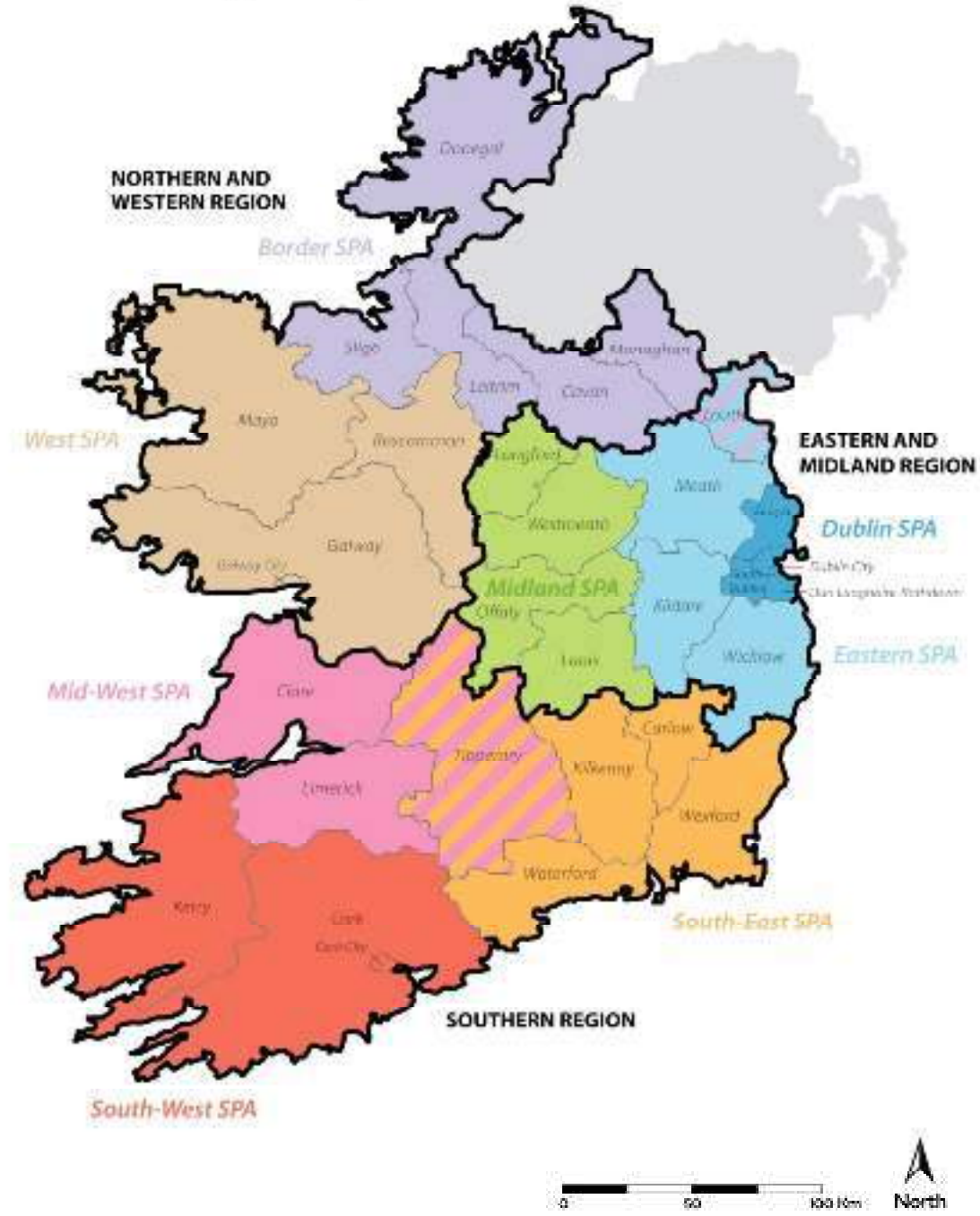
Figure 2: Ireland's Regions and Strategic Planning Areas (as per the Local Government Act 1991 (Regional Assemblies) (Establishment) Order 2014).