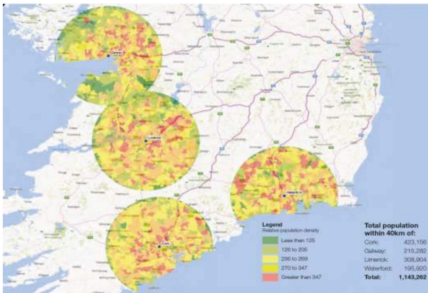
Figure 2: Relative population density in the Atlantic Cities regions

However, with the exception of Galway, population growth in these cities has lagged behind the national average, and current trends would indicate that the Greater Dublin Area (GDA) will further increase its share of the national population over the next 20 years.